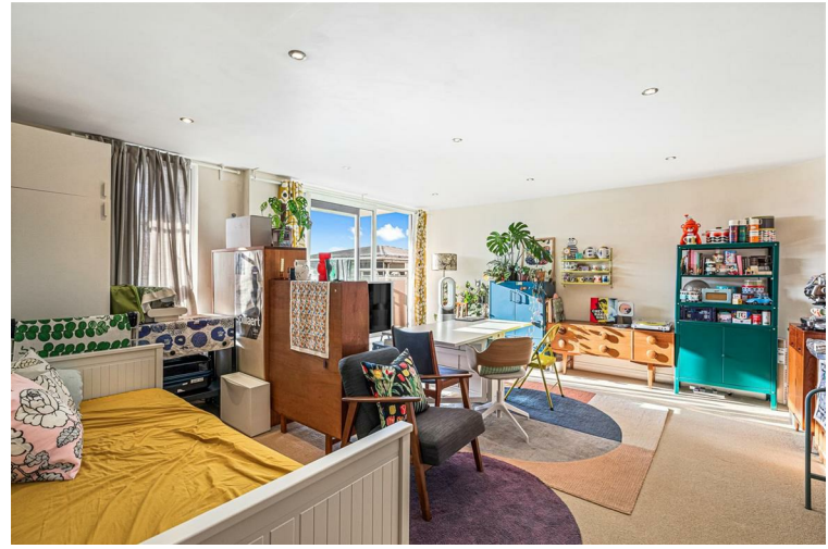
LOUNGE AREA 17'1" x 16'3" (5.23 x 4.96)

EARLY VIEWING HIGHLY RECOMMENDED CALL BARKERS 0116 270 9394